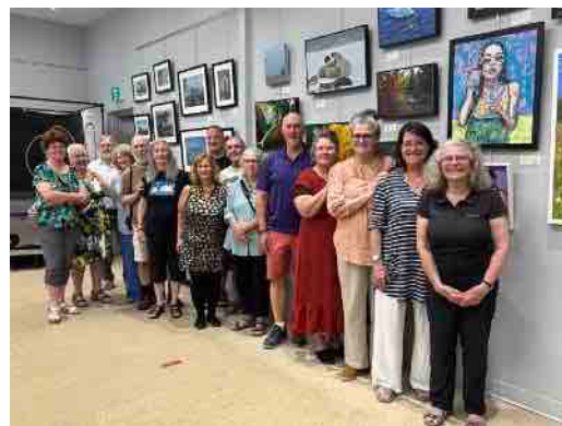
Our summer show 2025

Hats off to these wonderful stewards of the Northern Artists Gallery. Our group is in very capable hands!