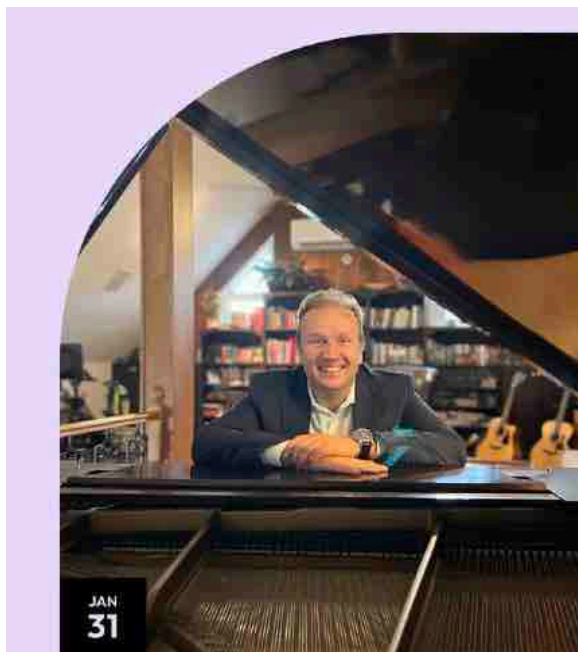
Sudbury Symphony Orchestra